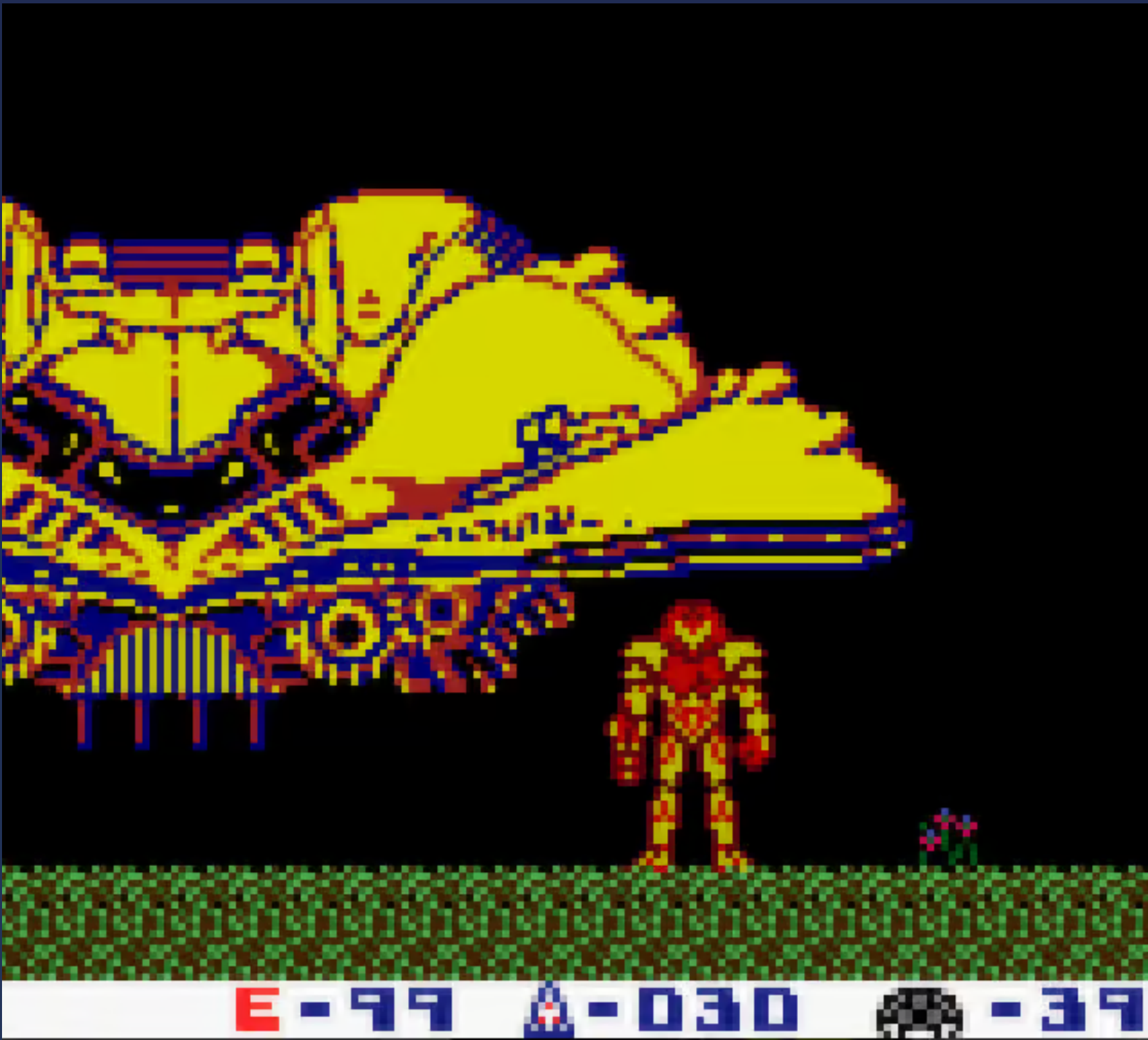
Metroid II DX Romhack

Announced via a news post by Nightcrawler , ROMhacking.net will be shutting down all portions of its site except for its forums and news. Current downloads and shared files have been sent to the Internet Archive for archival purposes.