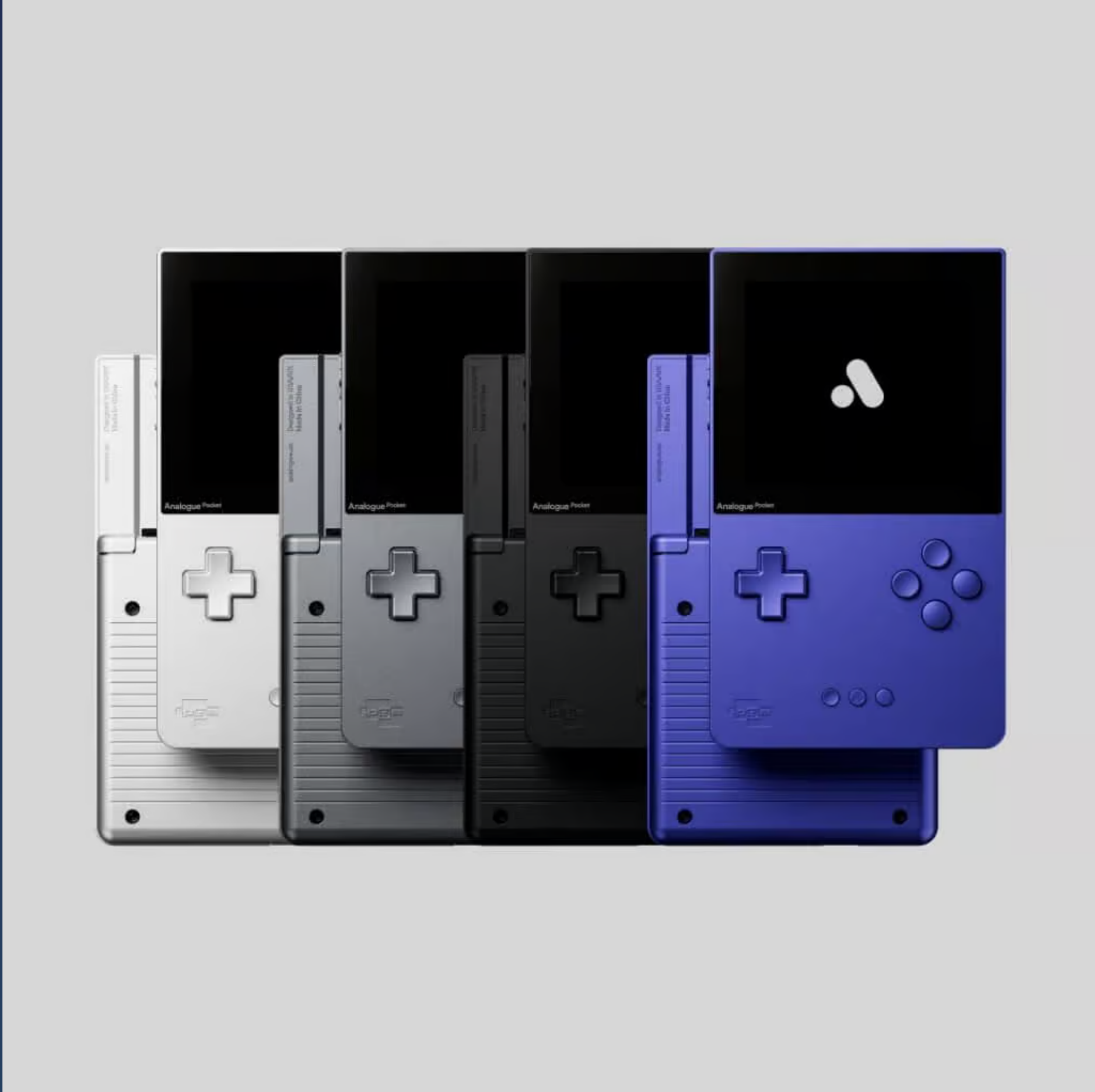
Analogue Pocket Aluminum Edition colors

Announced via Twitter, Analogue is launching an aluminum version of the Pocket. It comes in Natural (white), Noir (gunmetal), Black, and Indigo.